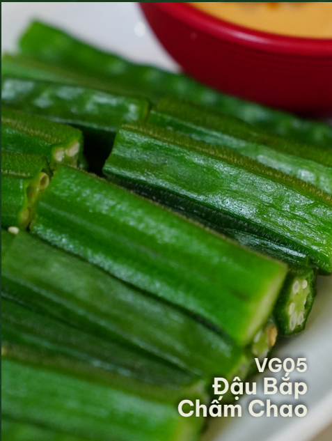
VG05 Đậu Bắp Chấm Chao