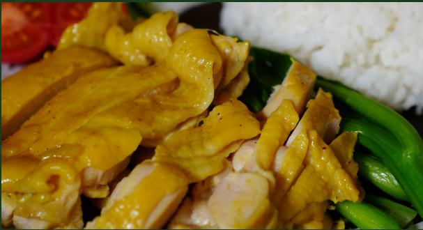
RC06 Cơm Gà Hội An Poached Chicken with Rice & Soup