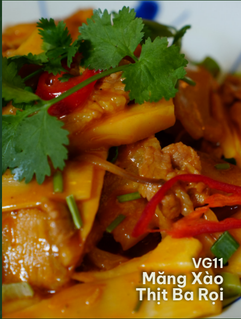
VG11 Măng Xào Thịt Ba Rọi