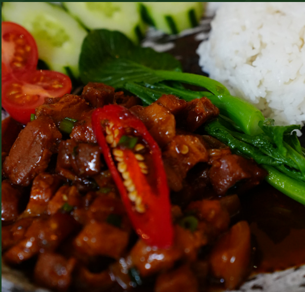
RC04 Thịt Ba Rọi Rim Mặn Kèm Thố Cơm Marinated Pork Belly with Rice