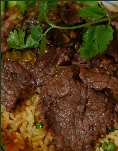
RC03 Cơm Chiên Dừa Bò Beef Fried Rice with Mustard Greens