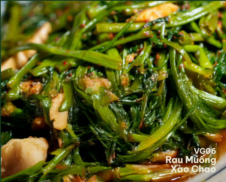
VG06 Rau Muống Xào Chao