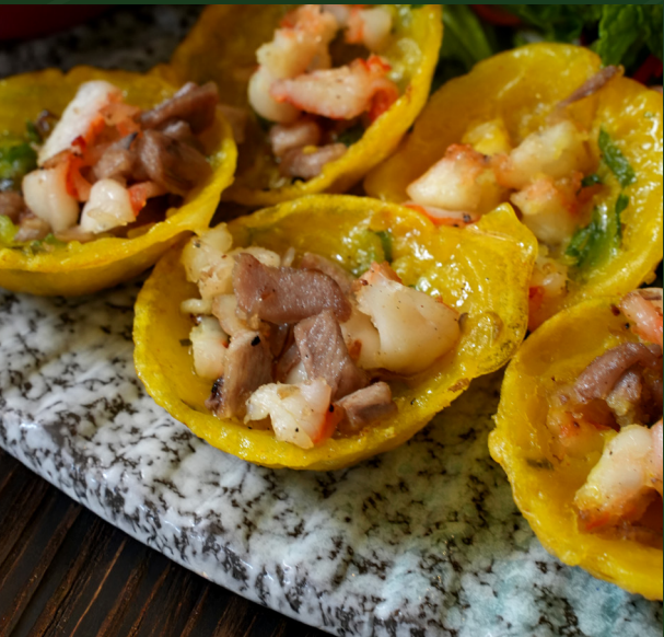
AP10 Bánh Khọt $20 Vietnamese Mini Savoury Pancake 5 pieces rice flour, prawn, pork, spring onion