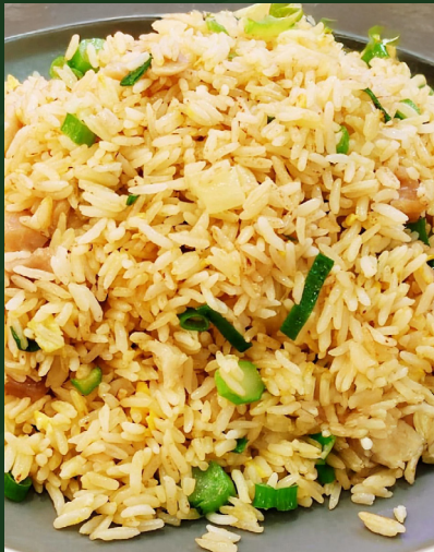
RC02 Cơm Chiên Gà Chicken Fried Rice