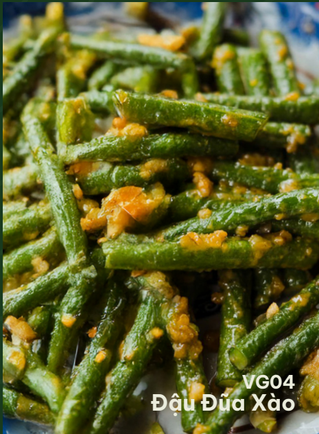
VG04 Đậu Đũa Xào