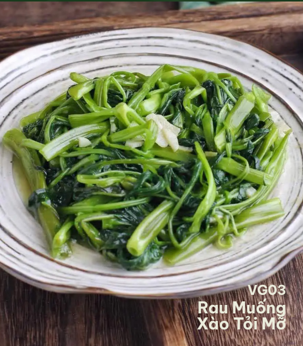
VG03 Rau Muống Xào Tỏi Mỡ

VG07 Rau Củ Quả Chấm Kho Quẹt ★ $18.8 Steamed Mixed Vegetables