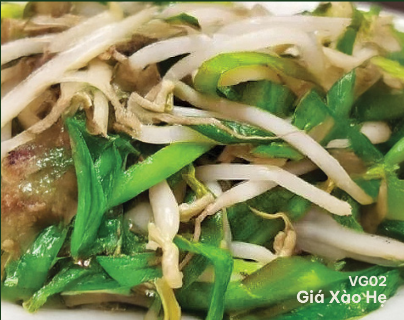
VG02 Giá Xào Hẹ

VG11 Măng Xào Thịt Ba Rọi $21.8 Pork Belly with Bamboo Shoots