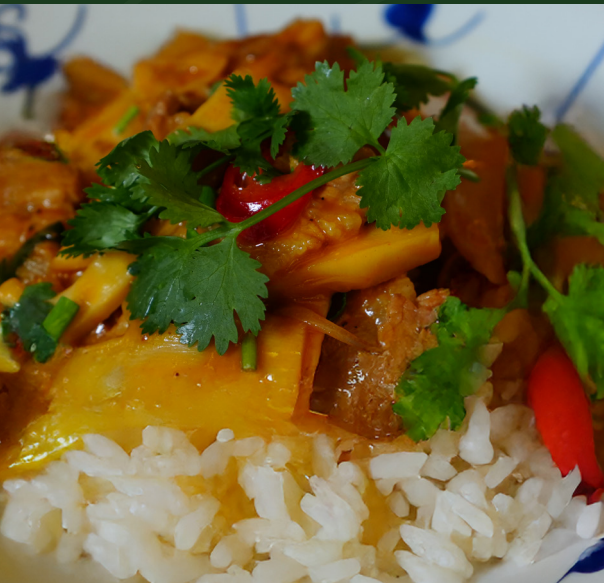
RC05 Thịt Ba Rọi Rim Măng Kèm Thố Cơm Pork Belly & Bamboo Shoots with Rice