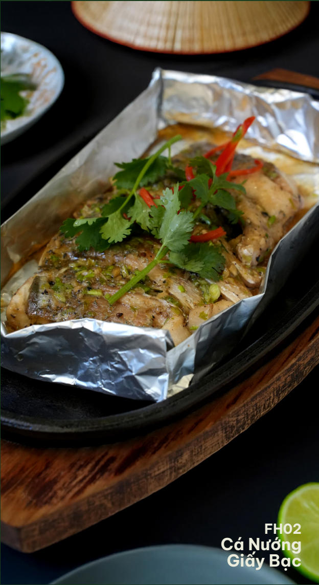
FH02 Cá Nướng Giấy Bạc