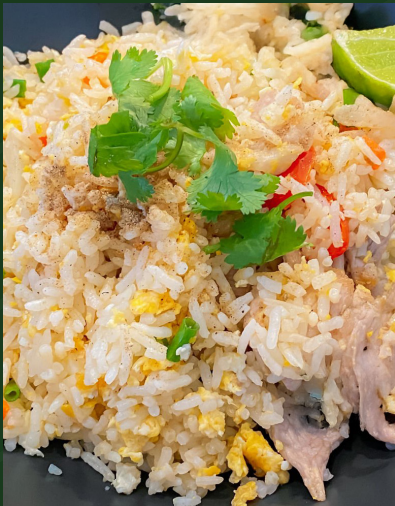
RC01 Cơm Chiên Trứng Egg Fried Rice