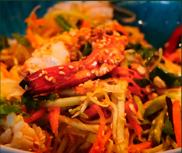
SL02 Gỏi Hải Sản ★ $24 Seafood Salad mango, prawn, squid, carrot, fresh herbs, lime