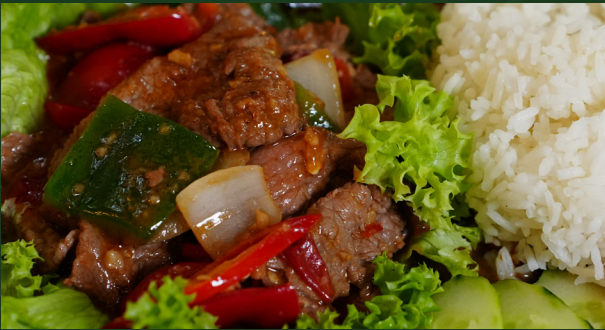
RC07 Cơm Bò Rendang Malaya với Achar Braised Beef Malayan Style & Crunchy Vegetables with Vietnamese Beef Broth