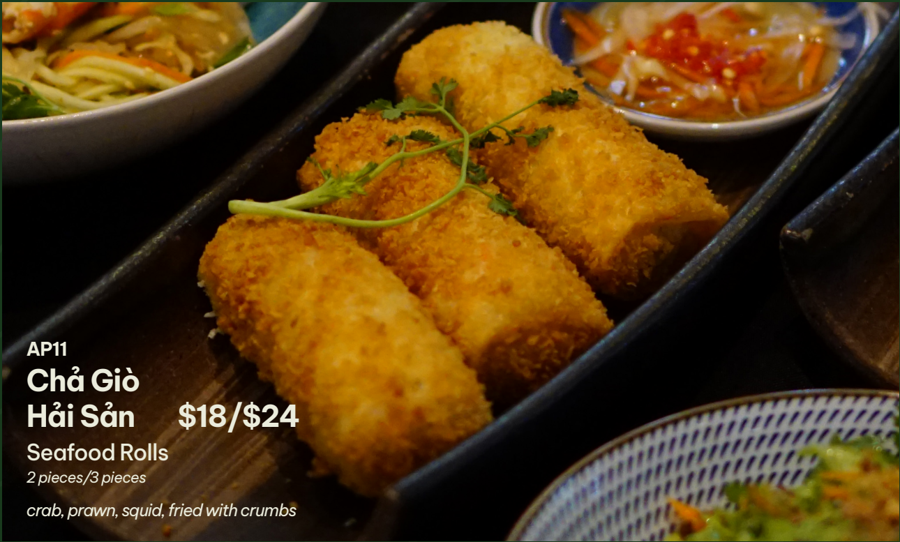
AP11 Chả Giò Hải Sản $18/$24 Seafood Rolls 2 pieces/3 pieces crab, prawn, squid, fried with crumbs