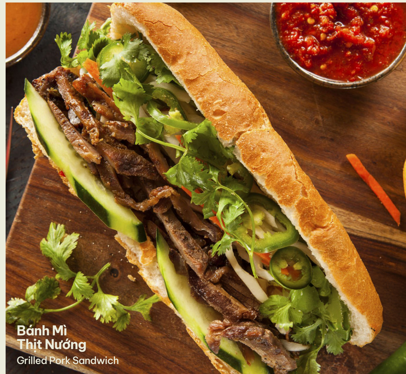
Bánh Mì Thịt Nướng Grilled Pork Sandwich

Prices are subject to GST & any other applicable surcharges & fees. Visuals are for illustration purposes only.