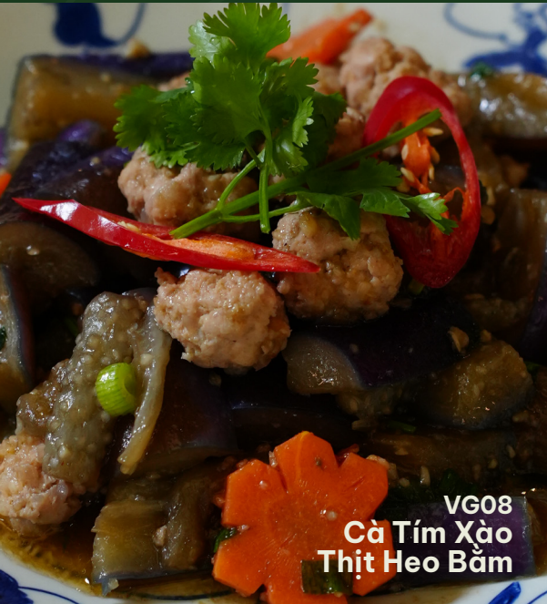
VG08 Cà Tím Xào Thịt Heo Bằm

VG06 Rau Muống Xào Chao $18.8 Water Spinach, Spicy Fermented Curd