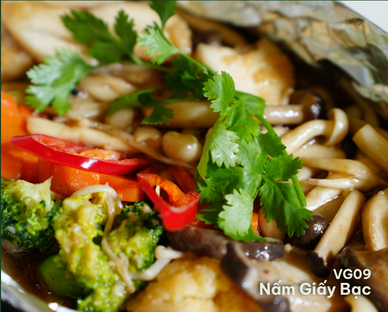
VG09 Nấm Giầy Bạc