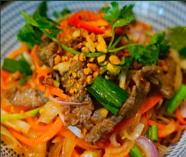
SL01 Gỏi Bò Tái $22 Beef Salad beef, prawn crackers, onion, carrots, peanuts, fresh herbs, lime, chili