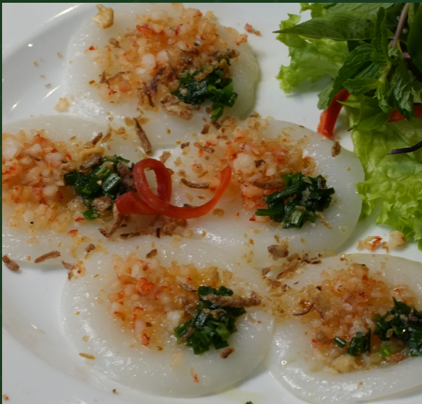
AP09 Bánh Bèo $18 Vietnamese Steamed Rice Cake 5 pieces rice flour, prawn, spring onion, fried shallot, olive oil